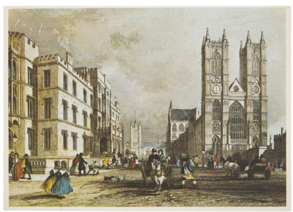
Westminster Hospital in 1840 in Broad Sanctuary, opposite Westminster Abbey