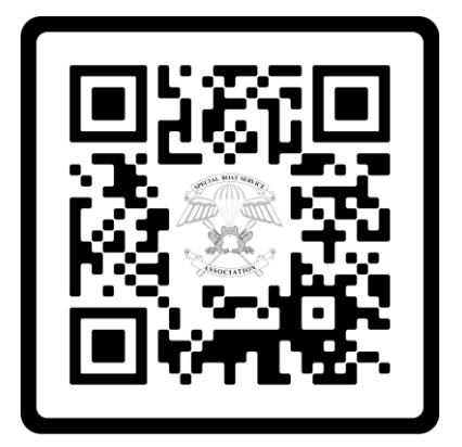
The SBS Association