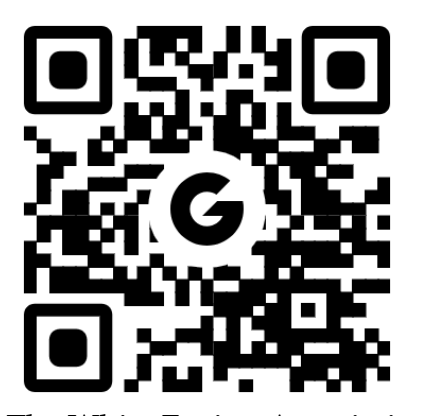
The White Ensign Association