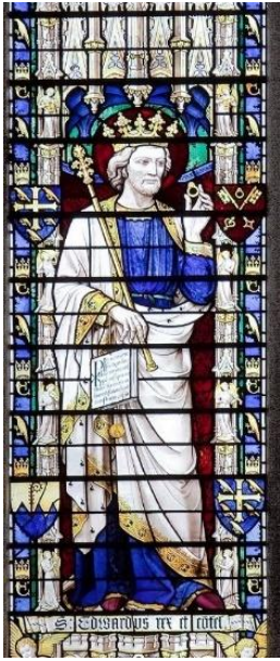
Edward the Confessor