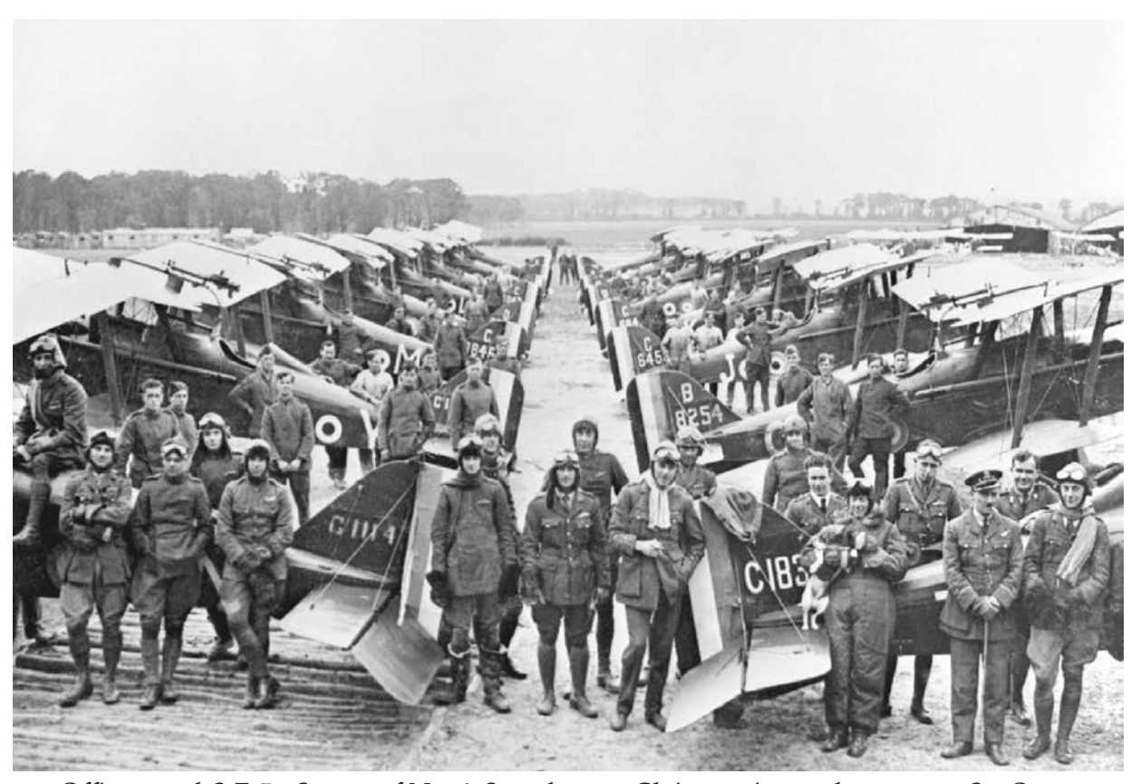
Officers and S.E.5a Scouts of No. 1 Squadron at Clairmarais aerodrome near St. Omer, 3 July 1918