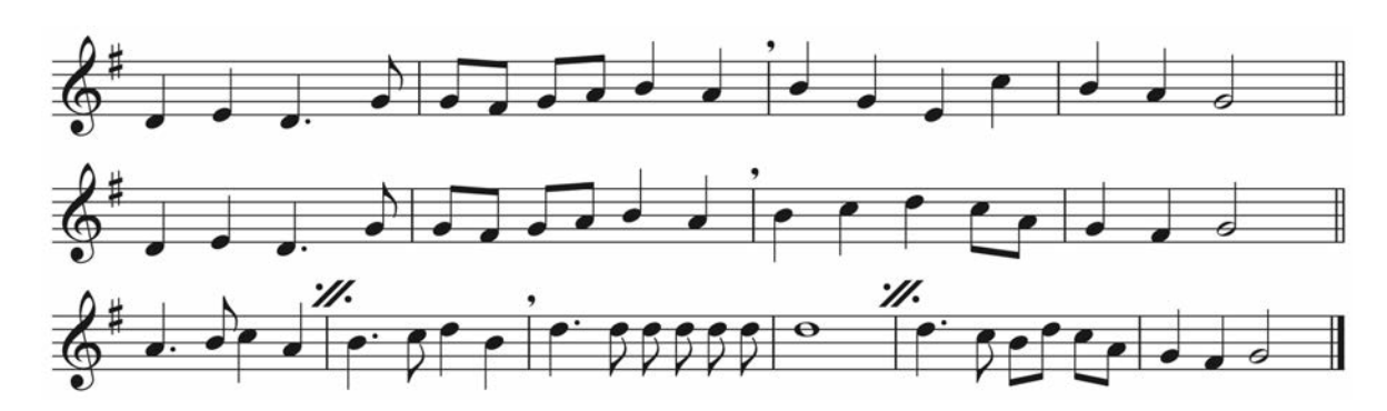
THE HYMN during which the RAF Ensign is recovered, and paraded to the east end of Quire

UIDE me, O thou great Redeemer, pilgrim through this barren land; I am weak, but thou art mighty; hold me with thy powerful hand: Bread of heaven, feed me till I want no more.