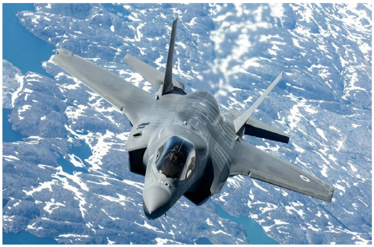
An F-35B Lightning of the RAF pictured over the coast of Greenland en-route from the United States during the aircraft's first visit to the UK in June 2016