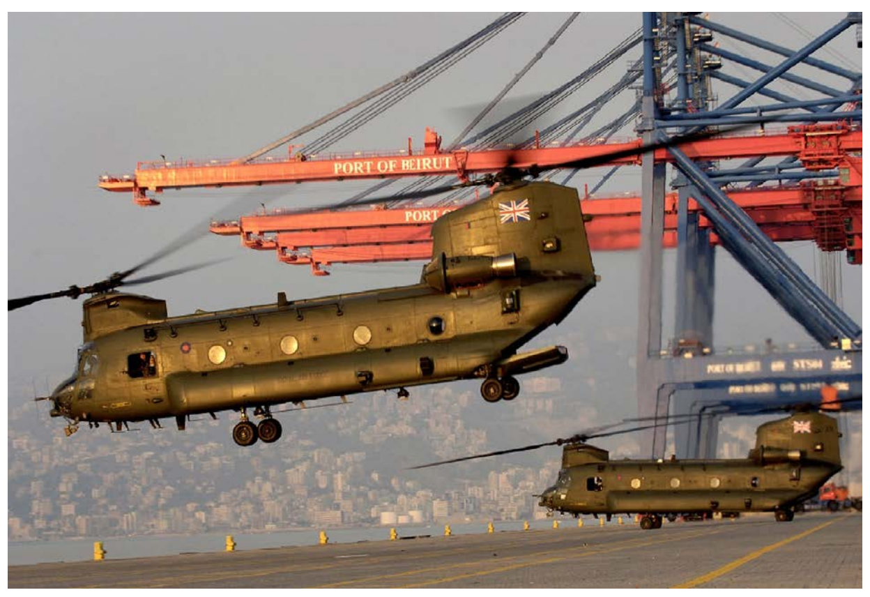
Chinooks of 27 Squadron evacuating British Nationals from Beirut during the Lebanon/Israel crisis in July 2006