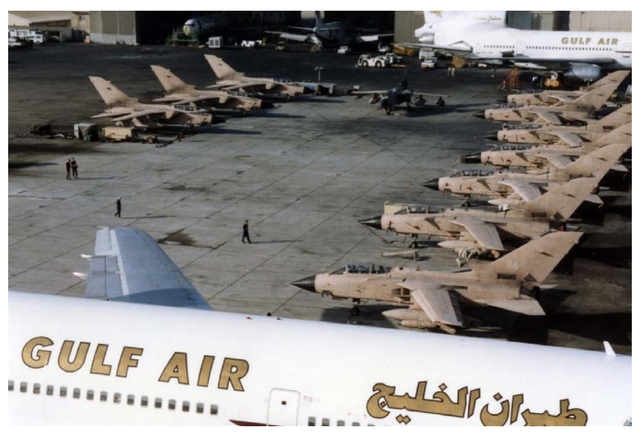
RAF Tornado GR.1s pictured at Muharraq, Bahrain, during Operation GRANBY in 1991