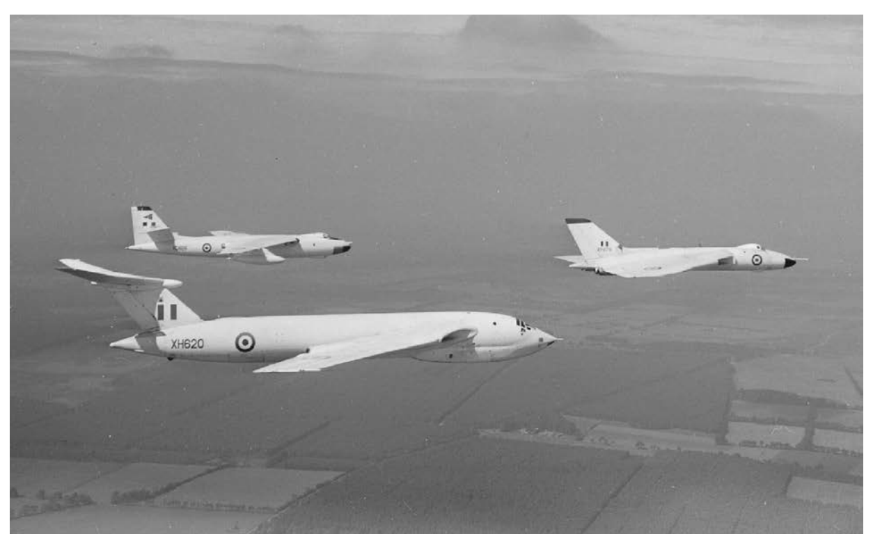
A trio of aircraft which formed the RAF nuclear deterrent of V-bombers seen in formation on 9<sup>th</sup> September 1960. Avro Vulcan B.1, XH497, of 101 Squadron (based at Finningley, Yorkshire) leads Handley Page Victor B.1, XH620, of 57 Squadron, and Vickers Valiant BK.1, XD829 of 90 Squadron (both based at Honington, Suffolk)